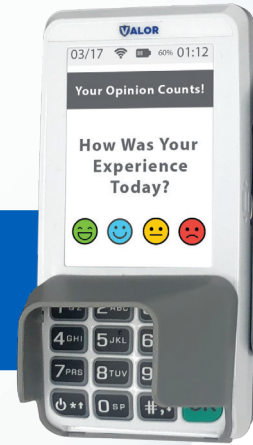
VL300 PIN Pad Solution