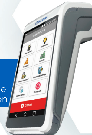
VL500 Wireless Pay At The Table Android Solution