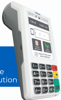
VL110 Wireless Pay At The Table Solution