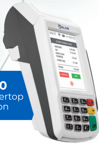
VL100 Countertop Solution